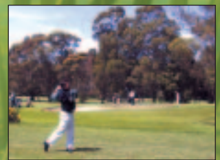
Bairnsdale Golf Club