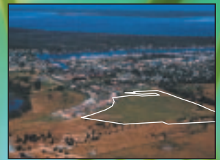
Toonlook Waters Aerial View

Experience an active lifestyle Experience environmental living Experience a lake in your backyard